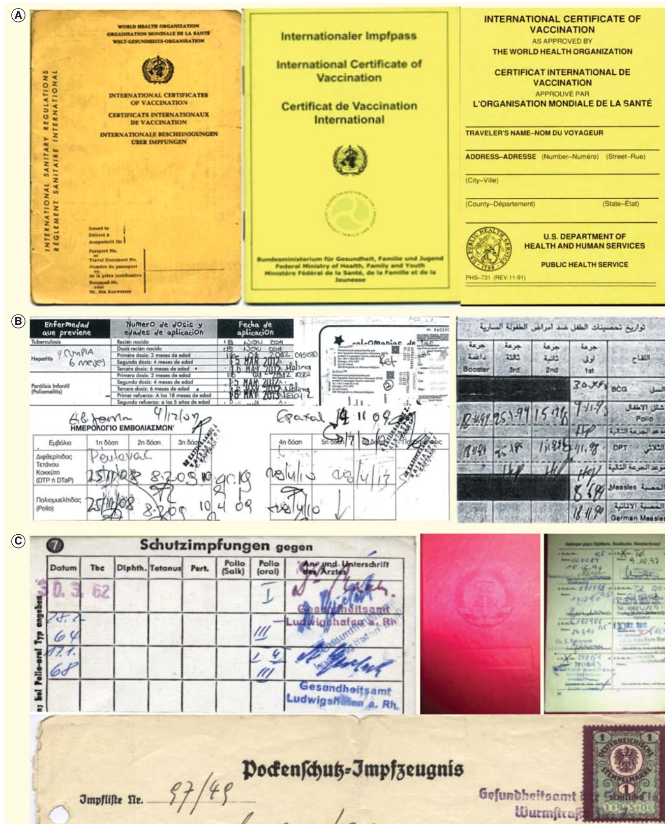
Figure 1. Examples of international vaccination records. (A) Examples of different WHO immunization records. (B) Excerpts from national immunization records (Columbia, Syria and Greece). (C) German vaccination records representing different birth years (1950, 1970 and 1990). Batch numbers, expiry dates as well as trade names are missing.